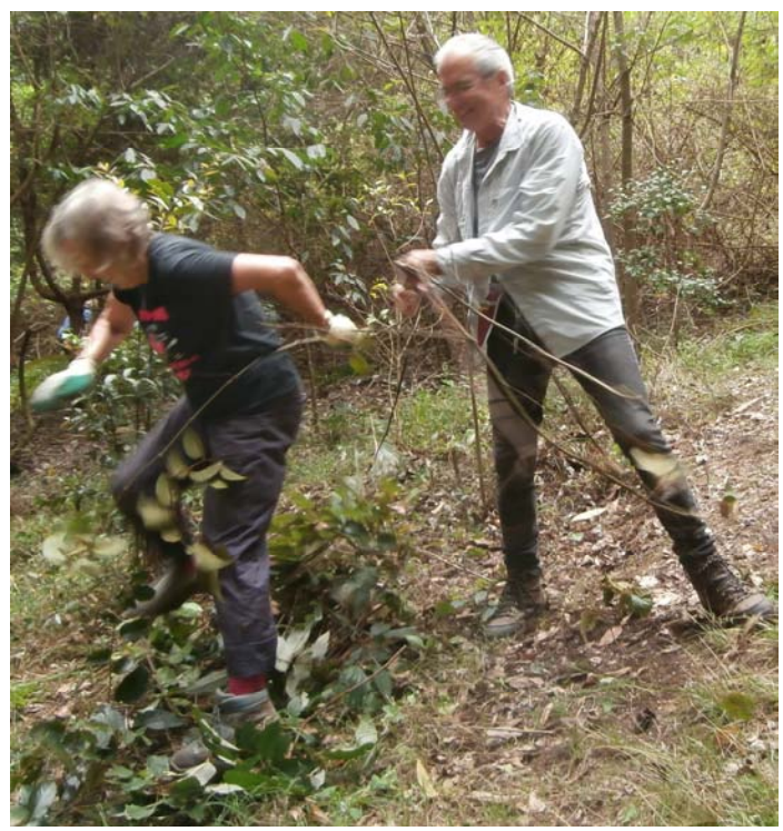
Supposed to be working