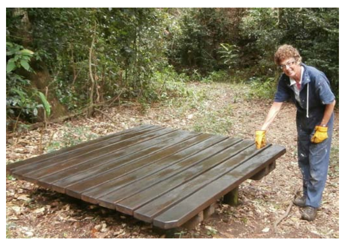
Great looking bench