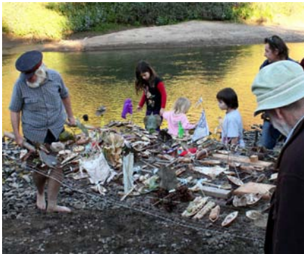
Launching of boats at Black Bean boat race Held every year on the Mary River at Pickering Bridge Gheerulla

A must for any visitor to the Conondales, this book includes history, a comprehensive bird list, description of walks, recreation and maps of the area. Plus lots of great photos.