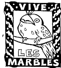
The Marbled Frogmouth can now relax in the Conondale National Park It's taken 25 years!

'Let it Be' and 'Frogmouth' T Shirts Available on line: www.exploreconondales.com