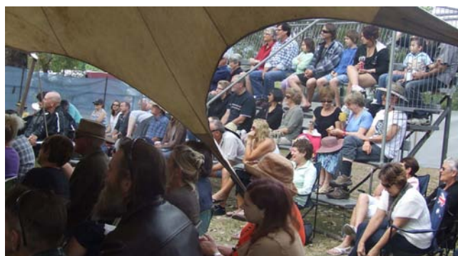
Poets Breakfast audience using the large 3 tiered stand

For more information contact Ian on 54 460 124