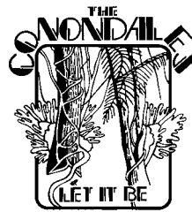
STILL... WATCHING OVER THE CONONDALES

Support the Conondale Range Committee Wear a Conondales T Shirt